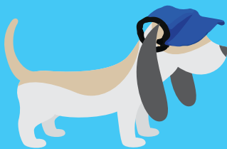
Hats with ultraviolet protection