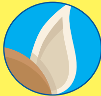
Tips of the ears