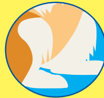
Groin and belly